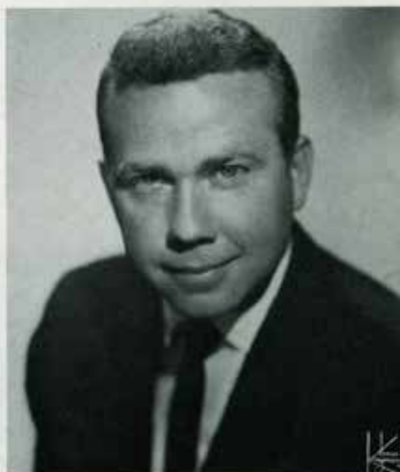
DON CHERRY COLUMBIA RECORDS