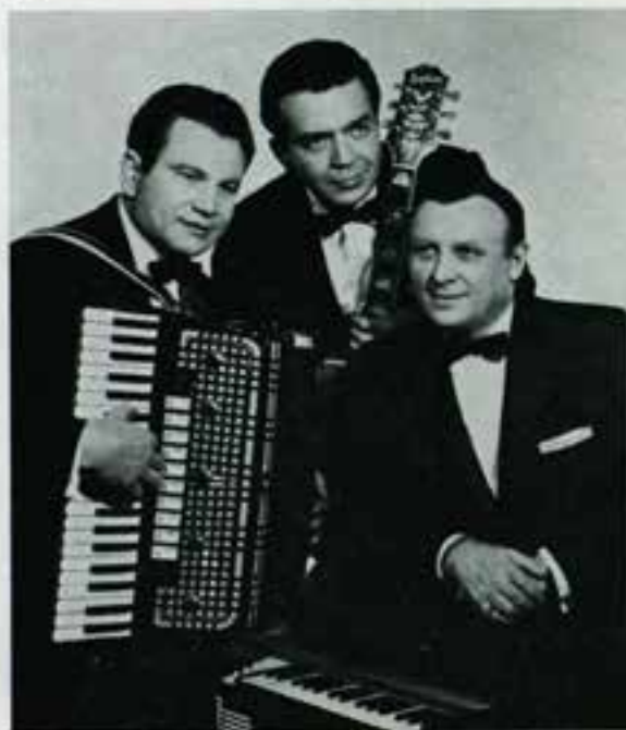
THE THREE SUNS RCA-VICTOR RECORDING STARS