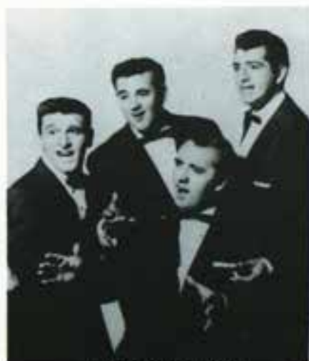
THE FOUR ACES