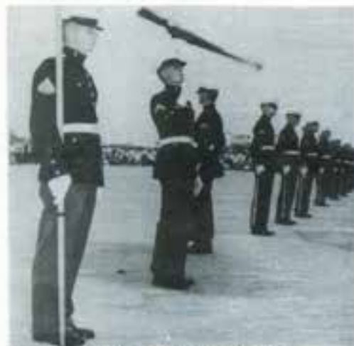
MARINE DRILL TEAM