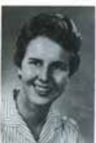
GEORGIA HIGH Publicity