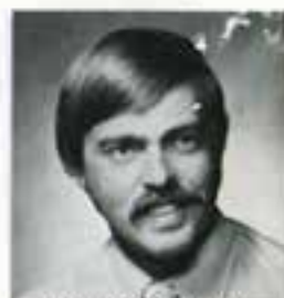
BOB COLEMAN Lighting