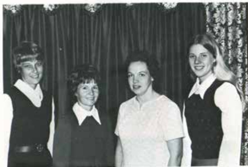
NEELAH DEB COMMITTEE