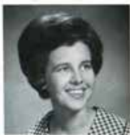
GEORGIA HIGH Director