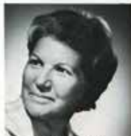
DOROTHY HALSEY Properties