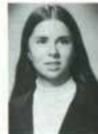
Michele Anne Sebastian Reed's IGA