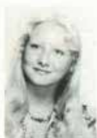
Susan Carroll Fashion Shoppe