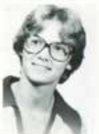
Lynn Eaton Lions Club