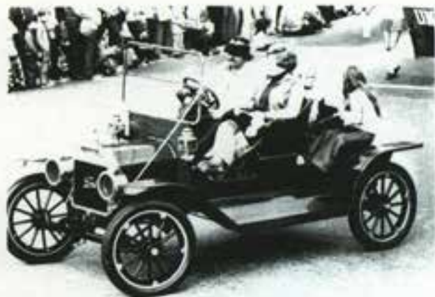
ANTIQUÉ CAR SHOW