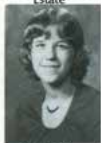
Julie Edds Union Gas System