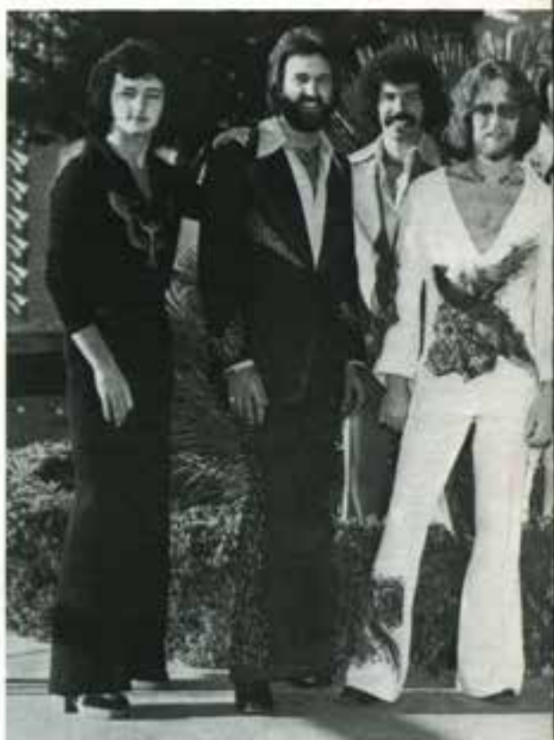
THE OAK RIDGE BOYS