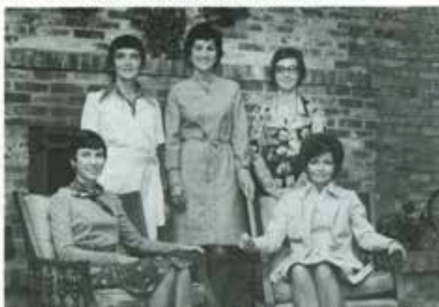
REGISTRATION AND TALENT COMMITTEE