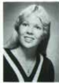
Lynn Parker Heritage Realty