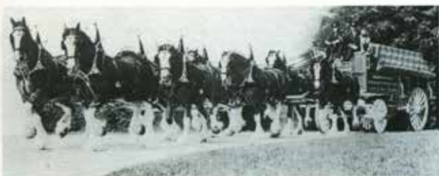
WITH THE CLYDESDALES