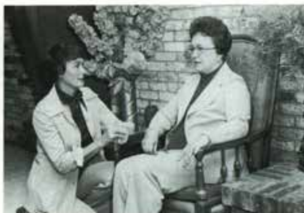
PUNCH PARTY COMMITTEE