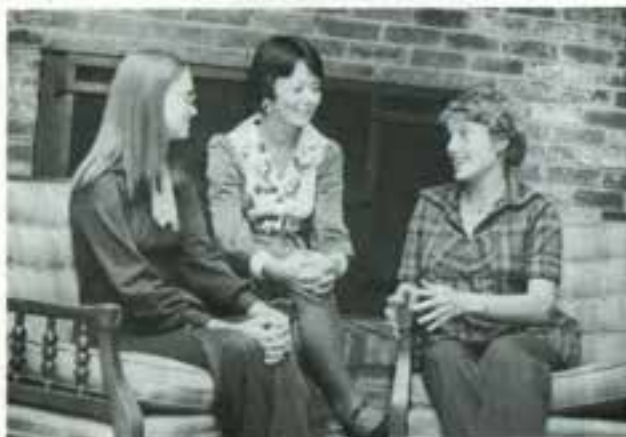
SASHES AND WINDOW DISPLAY