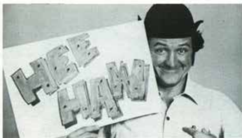
GEORGE "GOOBER" LINDSEY