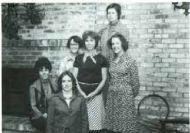
PRE-PARADE BRUNCH COMMITTEE