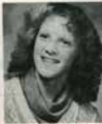
Allison Leach Day & Night Ladies' Apparel