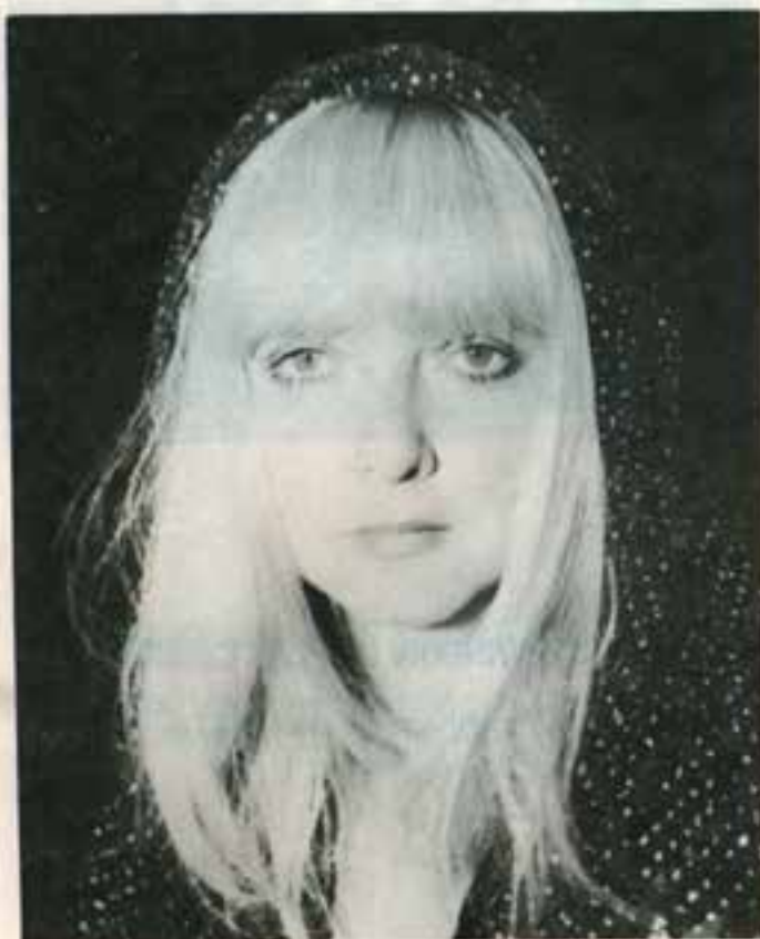
Maryla Rodowicz - Poland

Maryla Rodowicz is a renowned poet, songwriter and recording artist in her native Poland. She has appeared at numerous prestigious music events throughout Europe including the Palermo concert with Aretha Franklin and Duke Ellington. Her audiences in Germany, Hungary, Bulgaria, the U.S.S.R., Yugoslavia, Czechoslovakia, Italy and Austria have been unanimous in awarding her standing ovations.