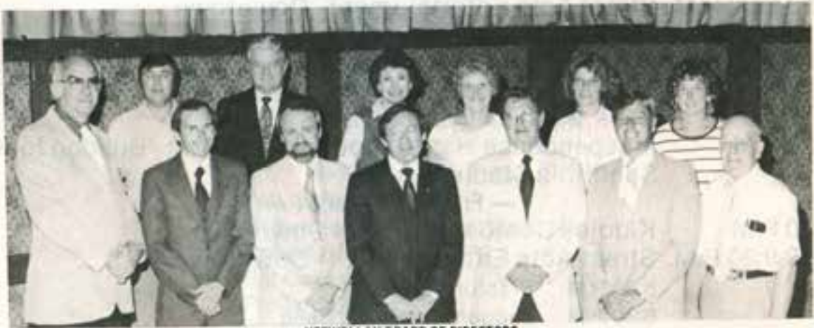
NEEWOLLAH BOARD OF DIRECTORS