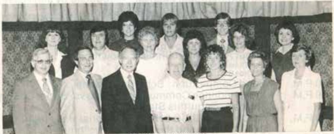
1980 NEEWOLLAH COMMITTEE