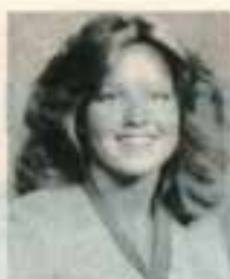
Beth Maxwell Security Abstract Co., Inc.