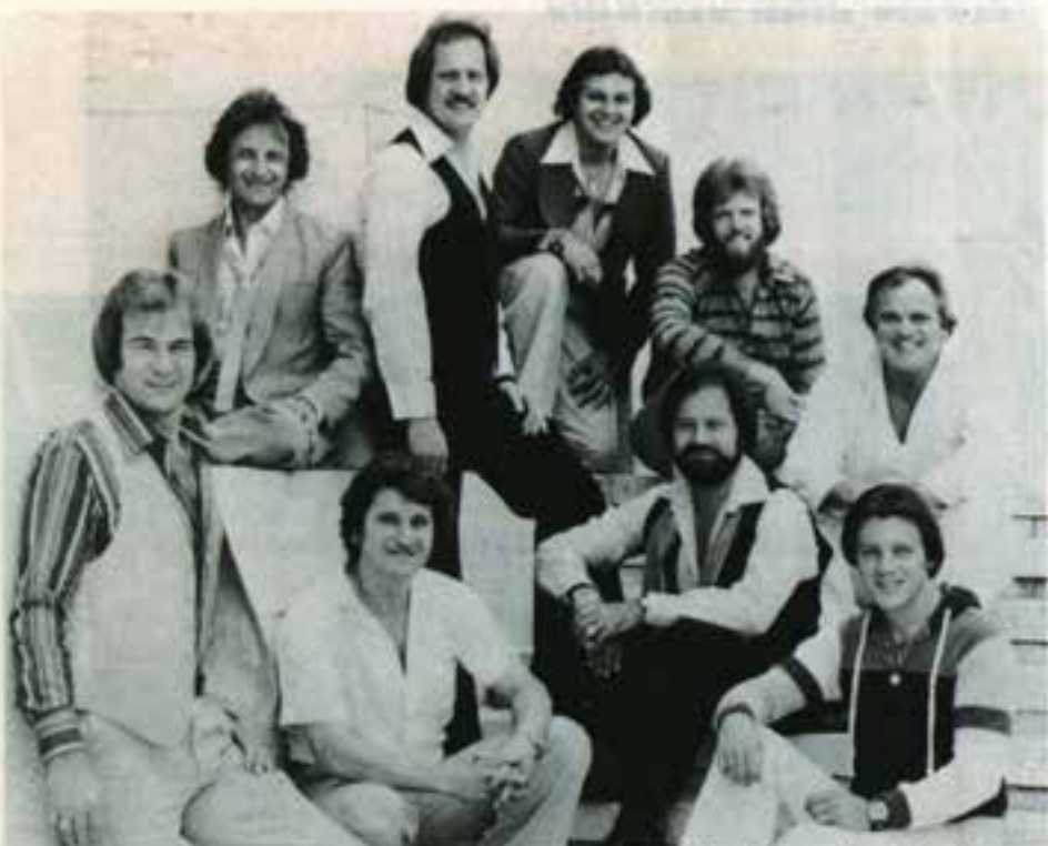
The Thrasher Brothers