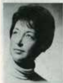
Edie Nieding Properties