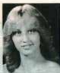
Charlene McCurdy Automotive Controls Corp.