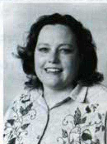
Janet Demo Neewollah Brochure